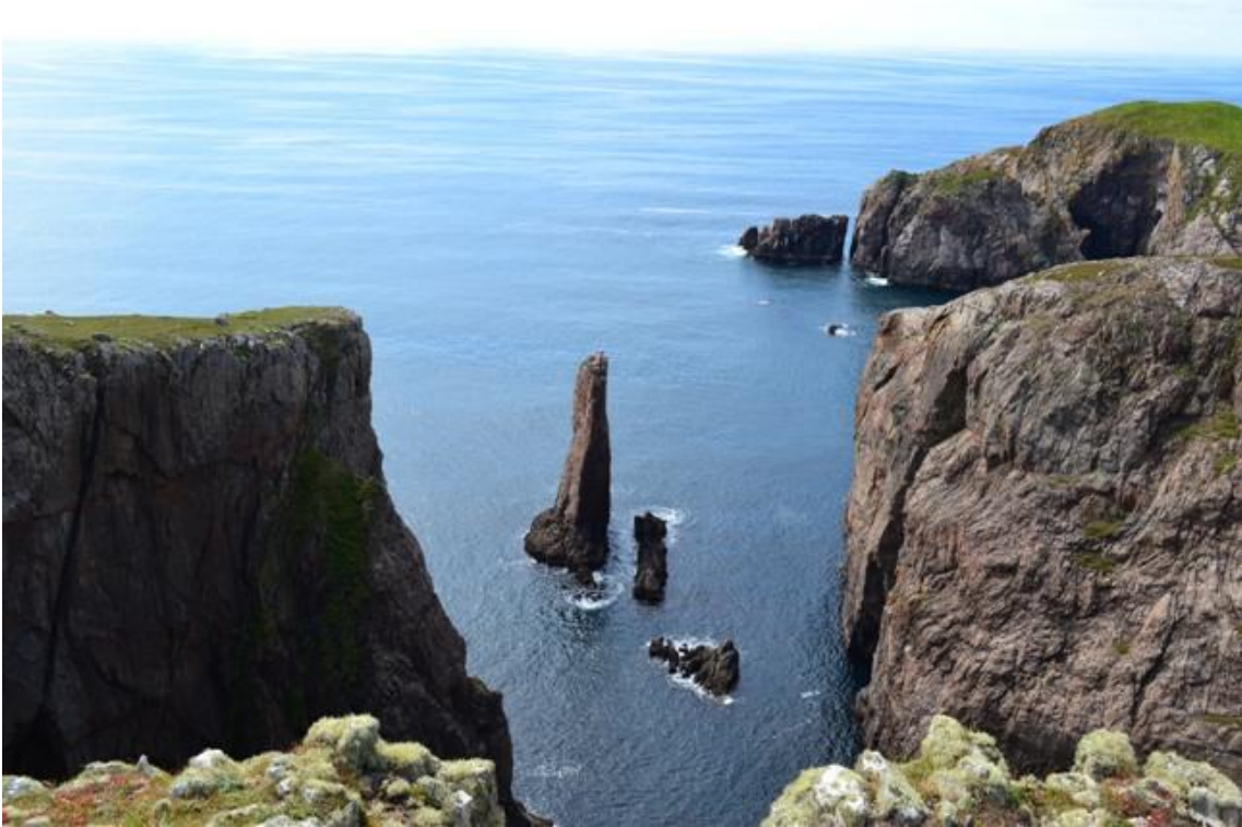
Climbers on summit of Stac an Iolar