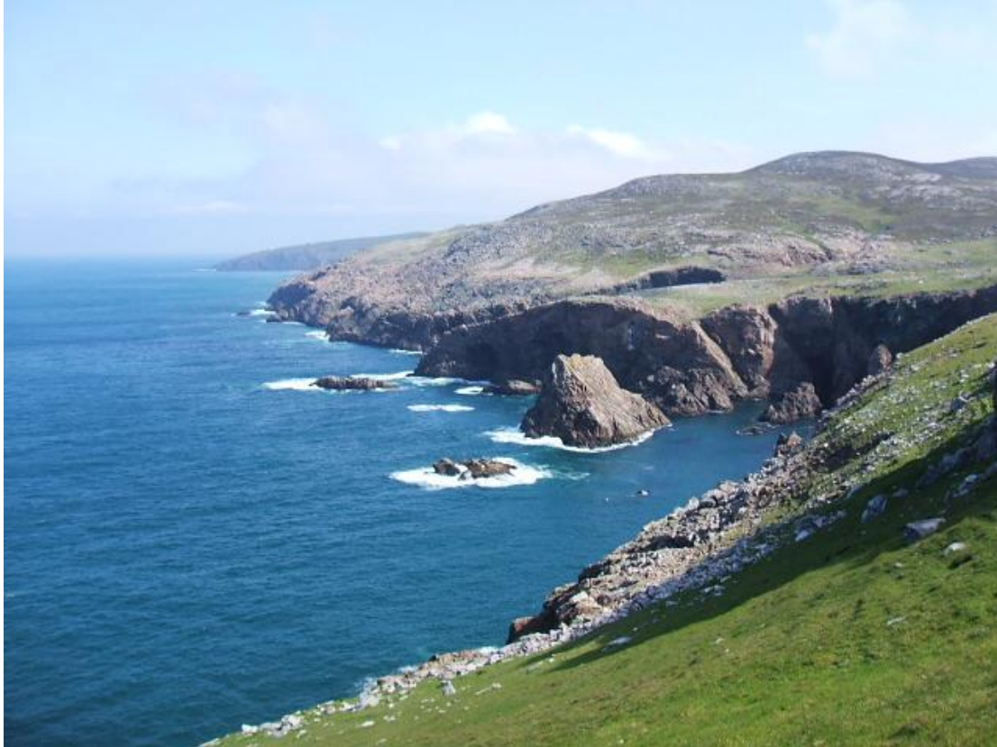
Humped Ridge Stack from the South

At the Southern end of the seaward face the steepness eases and quartz jugs become abundant.