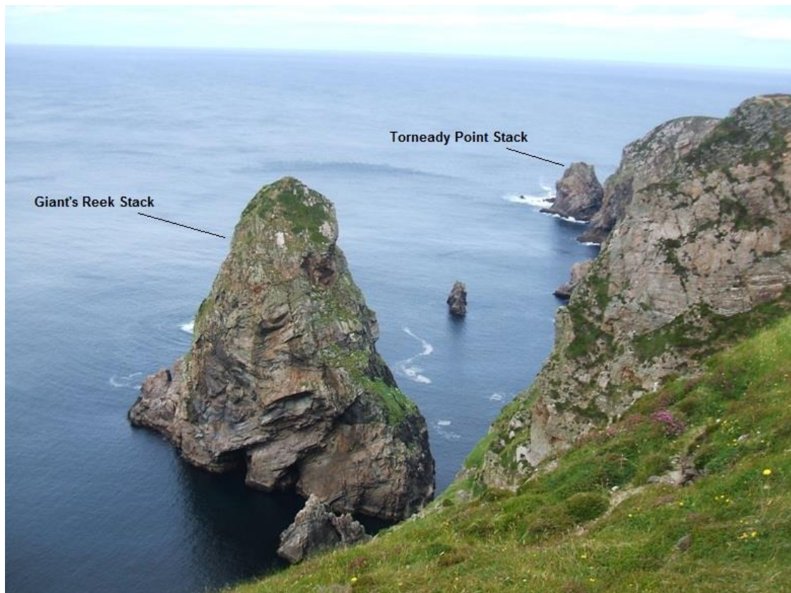
The Giant's Reek Stacks