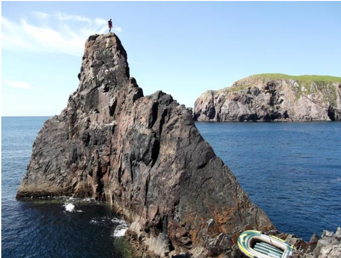
Summit of Dragon's Lair Stack