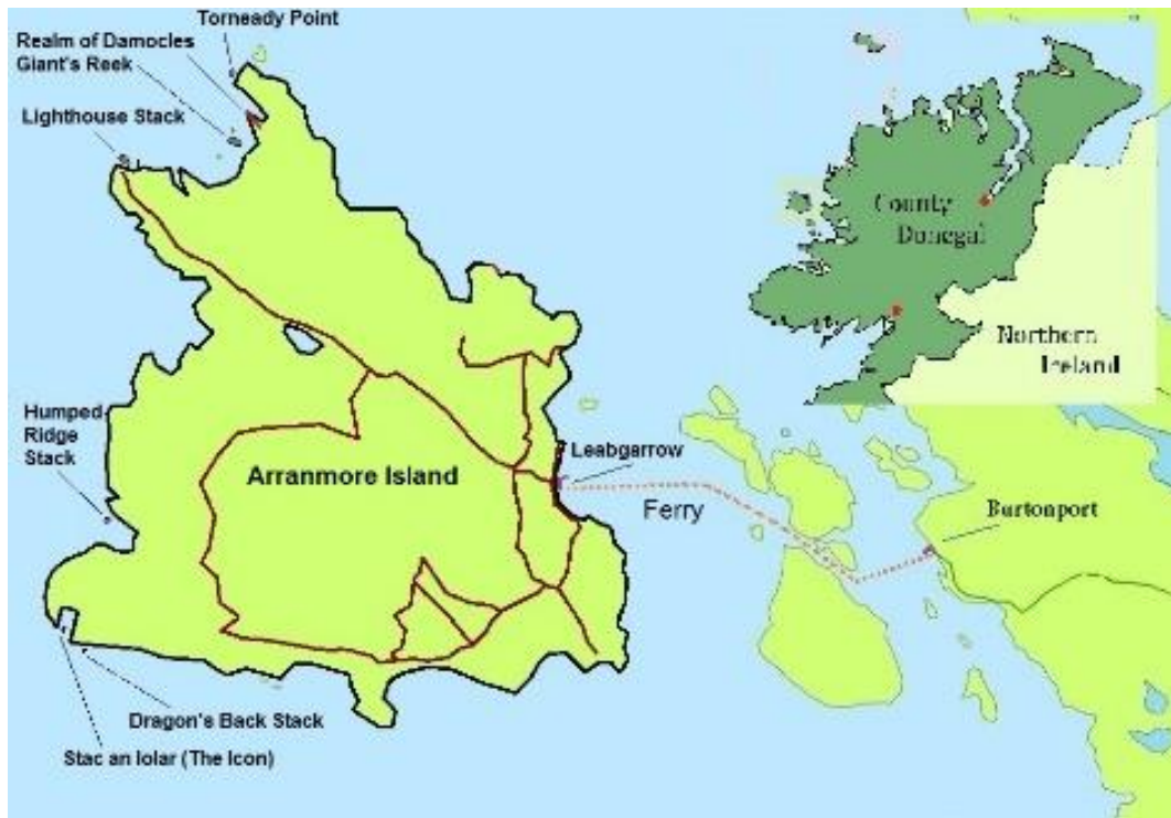
Arranmore Island Map

For more information on the island visit the collection of Arranmore pages detailing and the main climbing locations on the island at http://uniqueascent.ie/undiscovered_donegal .