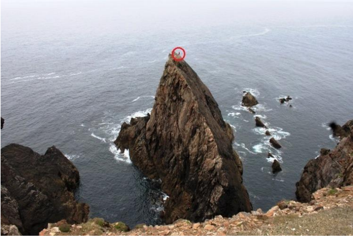
Standing on the Lighthouse Stack