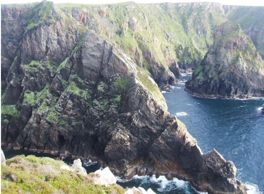
The Realm of Damocles Ridge